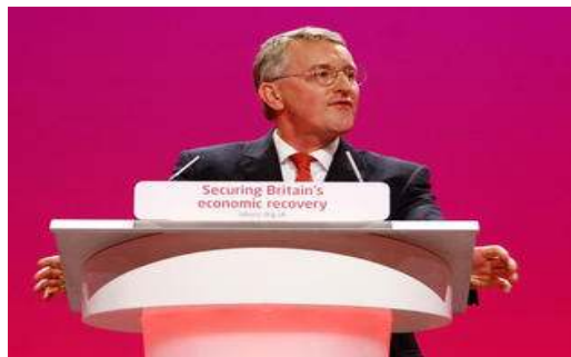
Environment secretary Hilary Benn announced the Government's intentions at the ongoing